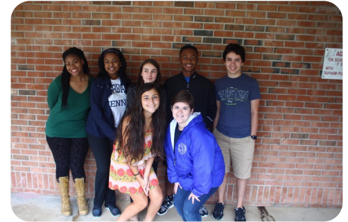
Publicity and Archives

Jordan's personal tutoring service will begin in October. The In-House tutoring will offer academic assistant to Jordan students every Tuesday morning and Thursday afternoon.